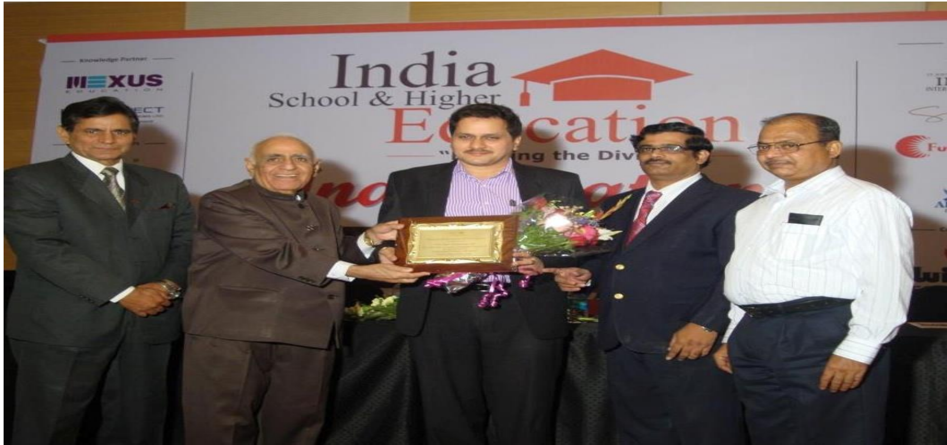
Visitex award for popularizing e-education.